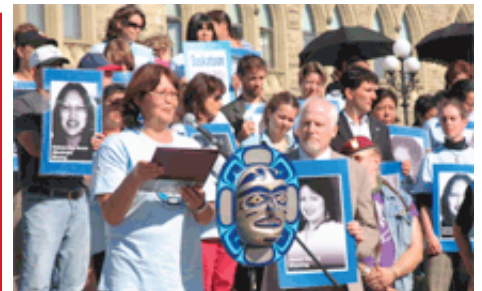
Amnesty International Vigil in Ottawa, Canada honoring missing and/or murdered Native women.

tribute to the gang by trading sex for drugs and money. He routinely drove her to meet 'dates.' "He told me he loves me and that all his friends did the same thing with their girlfriends," she explained. "He said if I really loved him, I would do anything for him."