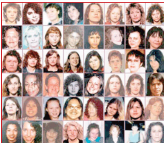
Missing Vancouver women. Most are Native and some may have been Pickton's victims.