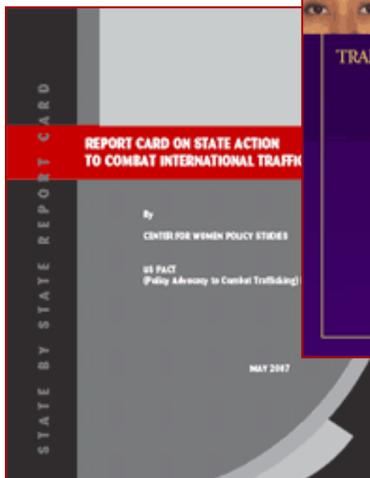
Report Card on State Action to Combat International Trafficking by the Center for Women Policy Studies. (pg. 4, 6)