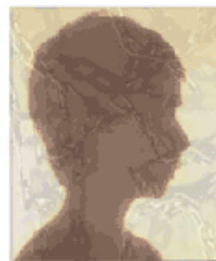
The U.S. Response to Human Trafficking: An Unbalanced Approach

Women's Commission for Refugee Women and Children May 2007