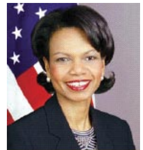
US Sec. State, Condoleezza Rice, June 3, 2005

tion or lack of education. Destination or demand countries, like the United States and other prosperous nations, whose citizens create the marketplace for trafficking, also bear a heavy responsibility.”