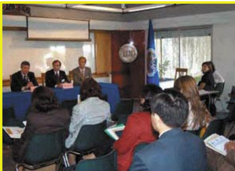
Participants in the workshop.

According to UNESCO it would cost an extra $10 billion per year to guarantee every child in the world at least a primary education of minimum quality. World governments spend that much on the military every four days.