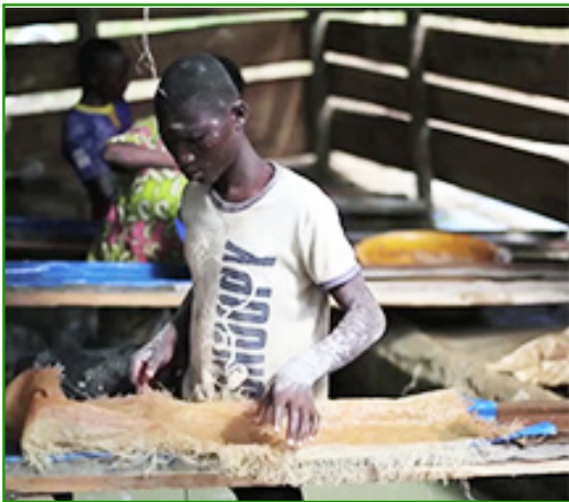
13-year old Ghanaian boy enslaved in a gold mining enterprise.

5). Adoption of Anti-slavery Practices by International NGOs. Training on how to recognize slavery and take action is being provided to a wide range organizations working in eastern Congo.