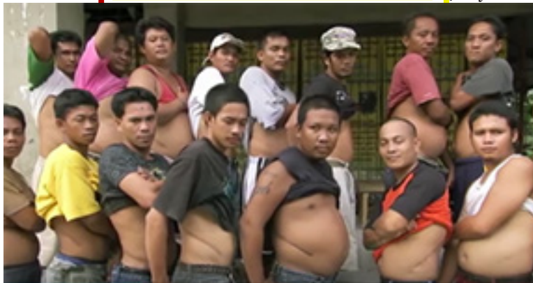
Photo taken from 'Tales from the Organ Trade'

In August 2016 the president of Indonesian instructed national police to investigate rampant human trafficking leading to organ trading in Indonesia. He had received reports of 27 people who had been trafficked to Malaysia and their organs taken from their bodies. One of the victims, a 14-year-old girl, was sent home dead with her internal organs cut out of her body and stitches along her spine, indicating that her body had been cut open for the procedure. ( http://www.thejakartapost.com/news/2016/08/01/national-scene-human-trafficking-leads-organ-trade-ntt.html )