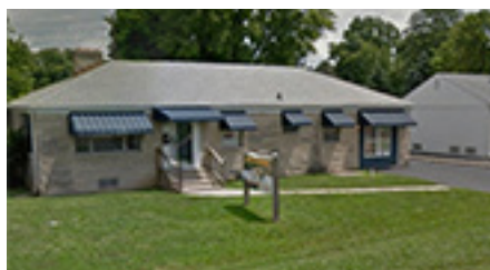
IMB raid in Indianapolis in October 2016 closed seven fronts, such as this, for prostitution.