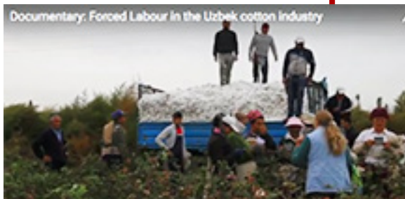
Forced cotton harvesting in Uzbekistan

This Resource Guide is intended to help covered companies by offering recommendations about model disclosures and best practices for developing such disclosures. In each disclosure category, the Guide discusses how a company can provide disclosures that comply with the law, as well as enhance consumers' understanding of the company's anti-trafficking and anti-slavery efforts.