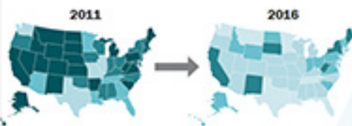
Shared Hope International’s scorecard on laws protecting children from sexual exploitation.