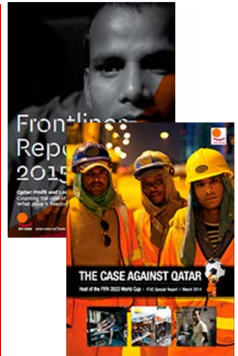
Frontline: Qatar: Profit and Loss

floor. Men working for one contractor claim there are up to 13 men sleeping to one room. "There are no cupboards or anywhere to keep our clothes or any goods ... we have to keep everything on our bed," explained one worker. "They only turn on the water [in our camp] for an hour. Five minutes in the morning, and one hour at night," said one, who lives in a nearby camp. "The air-conditioning is installed but they don't switch it on ... there's not even a lock on our door." ( http://www.theguardian.com/global-development/2016/mar/31/migrant-workers-suffer-appalling-treatment-in-qatar-world-cup-stadiums-says-amnesty )