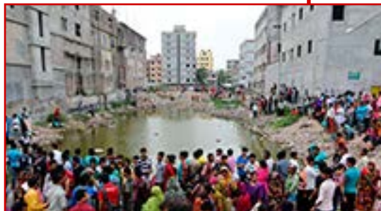
Families gather to remember the 2013 tragedy.

Workers reported that supervisors constantly shouted and rarely praised them for their labor. Work quotas were constantly the goal, and workers were forced to work