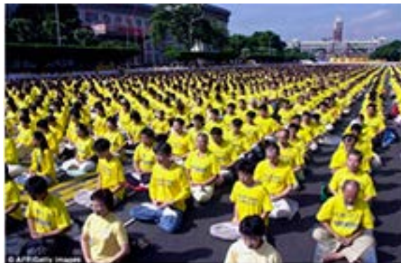
(Right) Thousands of Falun Gong practitioners sit in silent protest in front of the presidential office in Taipei, Taiwan.

In recent years China has been heavily criticized by the United Nations for its use of death row prisoners for organ transplanting. Laws preventing organ tourism to China are being instated around the world and are already in place in Israel and Spain. Both the U.S. Congress and the European Parliament have passed resolutions condemning the Chinese regime's practice of forced organ harvesting from prisoners of conscience and asked China to stop such a practice. Canada's recent 'Subcommittee on International Human Rights' also unanimously passed a similar motion. "It's a start, but a lot still needs to be done. Awareness and action at this point is really essential. We can't keep allowing this human rights abuse to continue," said Lee. Lee's documentary, 'Human Harvest,' was released in April 2015. ( http://www.dailymail.co.uk/news/article-3027088/A-Human-Harvest-Chinas-organ-trafficking-exposed-shocking-documentary-alleges-illegal-trade-worth-staggering-1-billion-year.html )