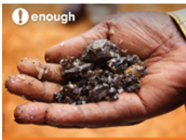
Taking Conflict Out of Consumer Gadgets

Company Rankings on Conflict Minerals 2012