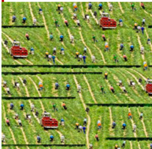
"People want their food to be cheap. Without a fair price will there ever be fair working conditions?" "Lowest on the Foodchain"

When male victims are not identified, they risk being treated as irregular migrants instead of exploited individuals and are vulnerable to deportation or being charged with crimes committed as a result of being trafficked, such as visa violations. Cases involving male victims are often dismissed as labor infractions instead of investigated as criminal cases. (TIP, pg. 35)