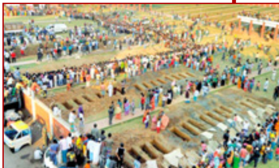
Digging graves for the unidentified victims of the fire.

The Government of Bangladesh suggested “sabotage” due to some evil plot to attack the Tazreen Fashion factory, as it had in 2010 when 29 people died in another garment factory fire.