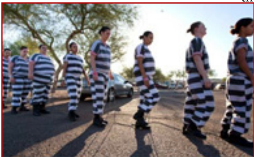
Women prisoners march to a bus that will take them to a worksite outside Estrella Jail in Phoenix, AZ.

(Guardian https://www.commondreams.org/view/2012/07/06-9 )