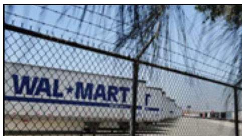
NFI Crossdock - Ontario, CA. Part of Walmart's American supply chain.