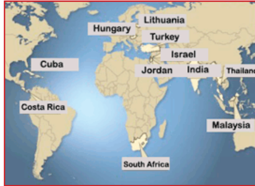
Countries Promoting Medical Tourism

Organ transplants were not possible to conduct until the 1970s when pharmaceuticals that prevented organ rejection were introduced to the medical community. Until then, there was no reason for legislation on the matter of organ trafficking, and as a result, there has been little international coopera-